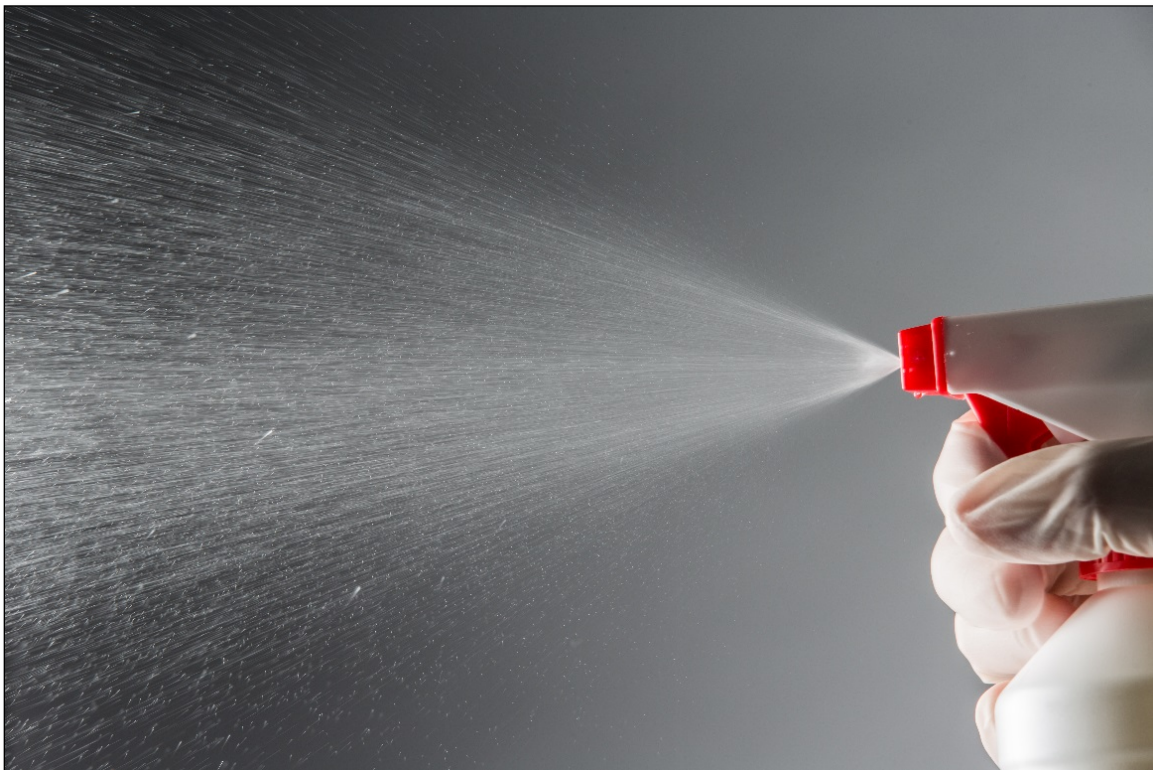
STERI-PEROX 3% & 6% 16 oz Trigger Spray

STERI-PEROX® solution is used for the cleaning of glass, plexiglass, walls, ceilings, floors, stainless steel, manufacturing equipment, packaging equipment, filling equipment, and most environmental, hard, non-porous surfaces that require the use of sterile hydrogen peroxide solutions in cleaning rotation cycles. STERI-PEROX helps to maintain a critical environment. It is compatible with many types of glove materials.