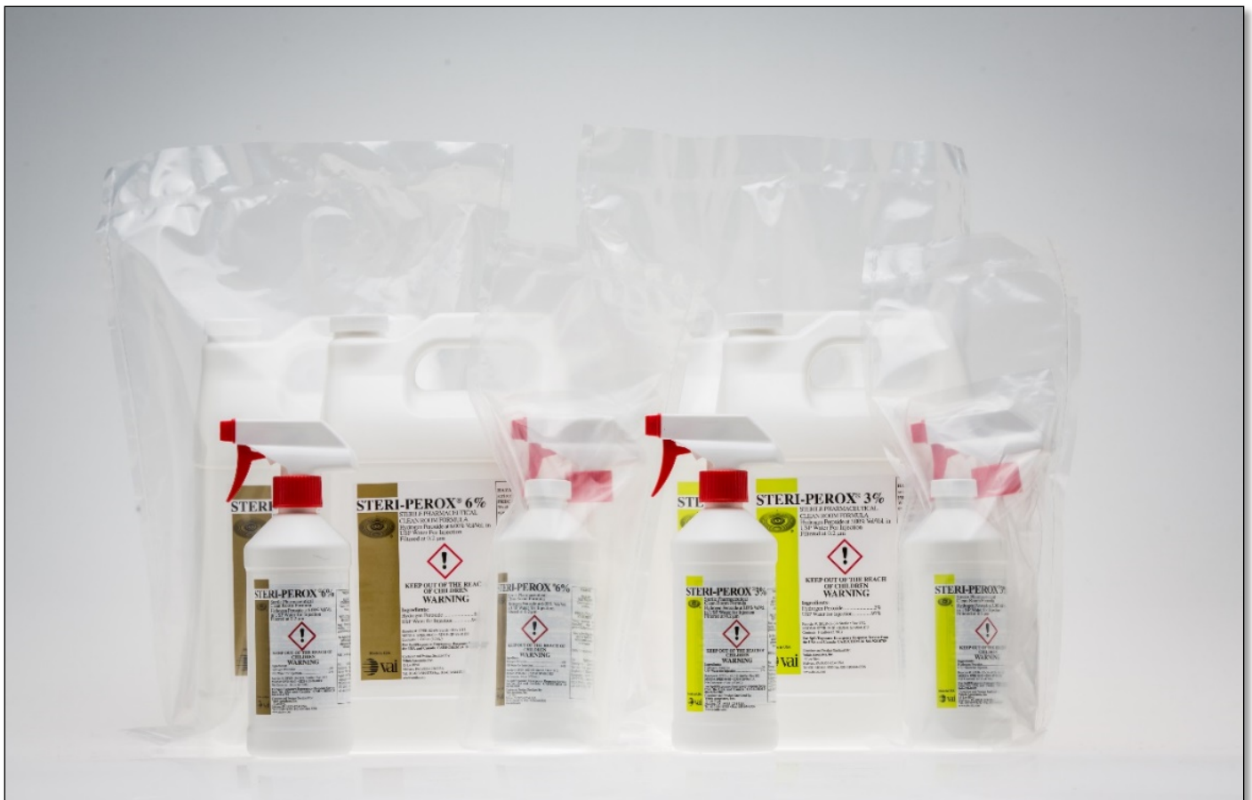
STERI-PEROX 3% and 6% Family of Products

(Any specific product label is available upon request.)