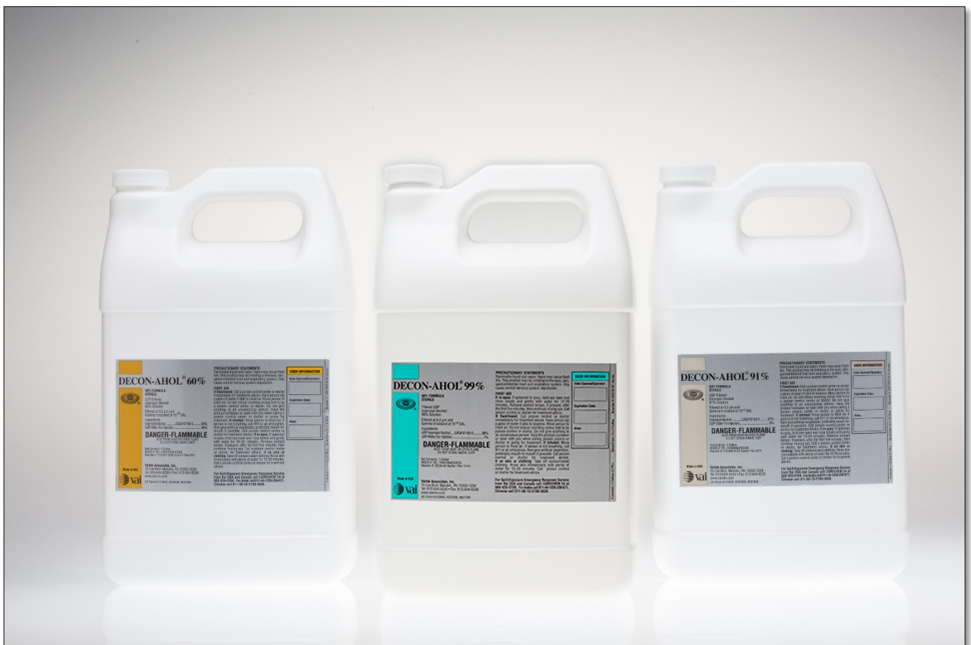
DECON-AHOL 60%, 91%, and 99% Family of Products

(Any specific product label is available upon request.)