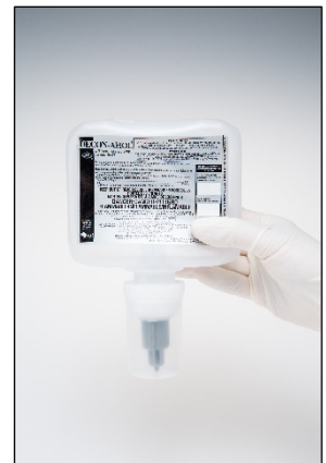
32 oz. Bottle DECWFI-BOT-02