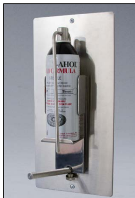
DEC-50 with DECWFI-SP-70