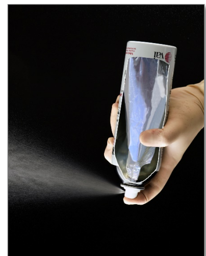
11 oz. Aerosol "Inverta Spray" DECWFI-SP-70-B