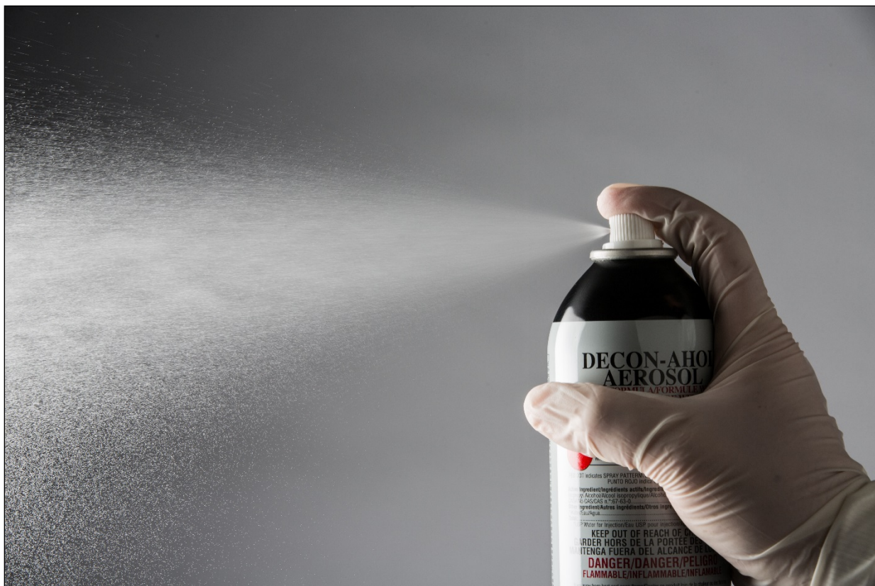
DECWFI-SP-70 Spray/Mist Aerosol

Container Disposal: Non-refillable container. Do not reuse this container. Offer for recycling where available or puncture and dispose of in a sanitary landfill, or by procedures approved by state and local authorities.