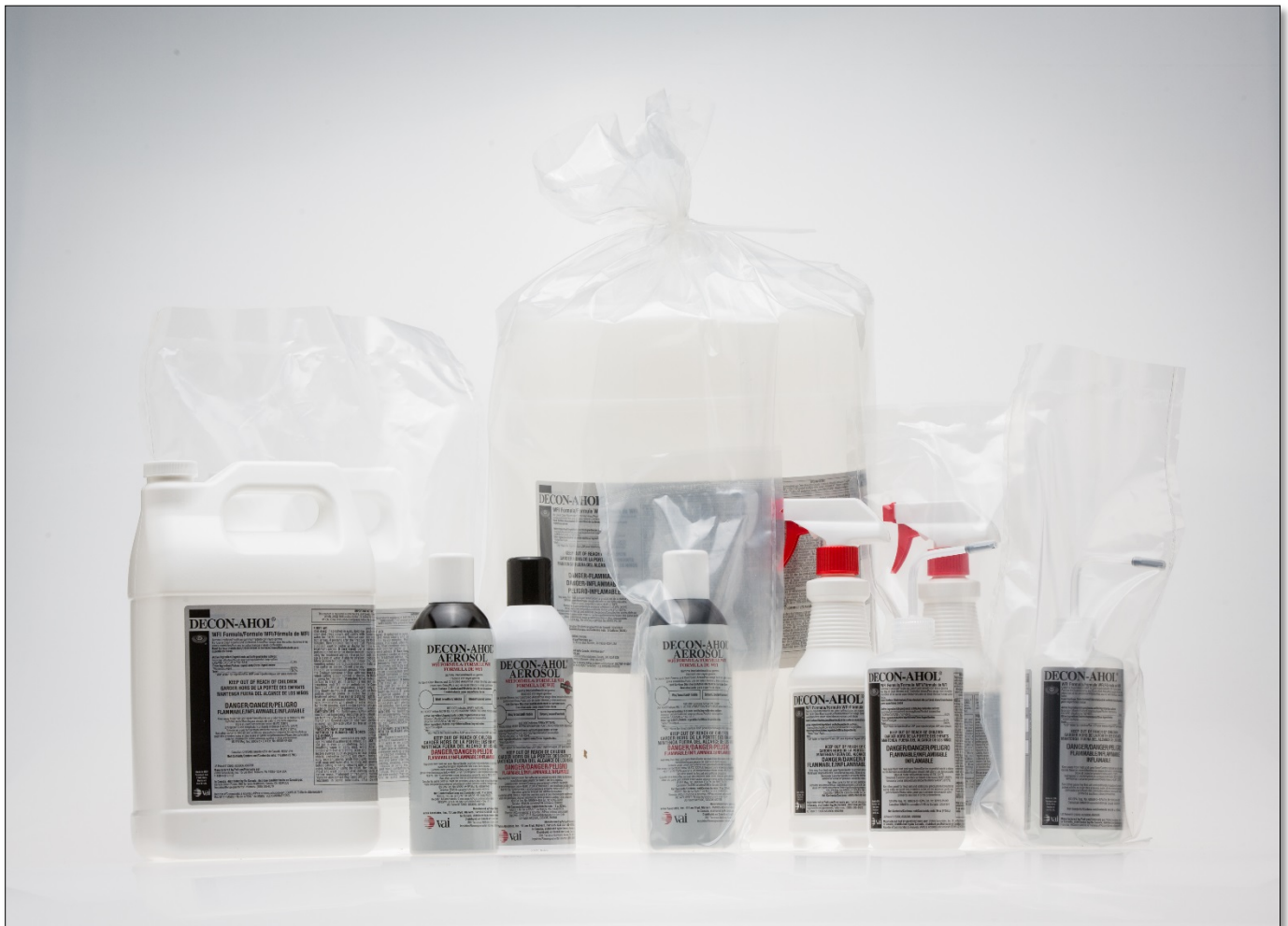
DECON-AHOL WFI Formula Family of Products

(Any specific product label is available upon request.)