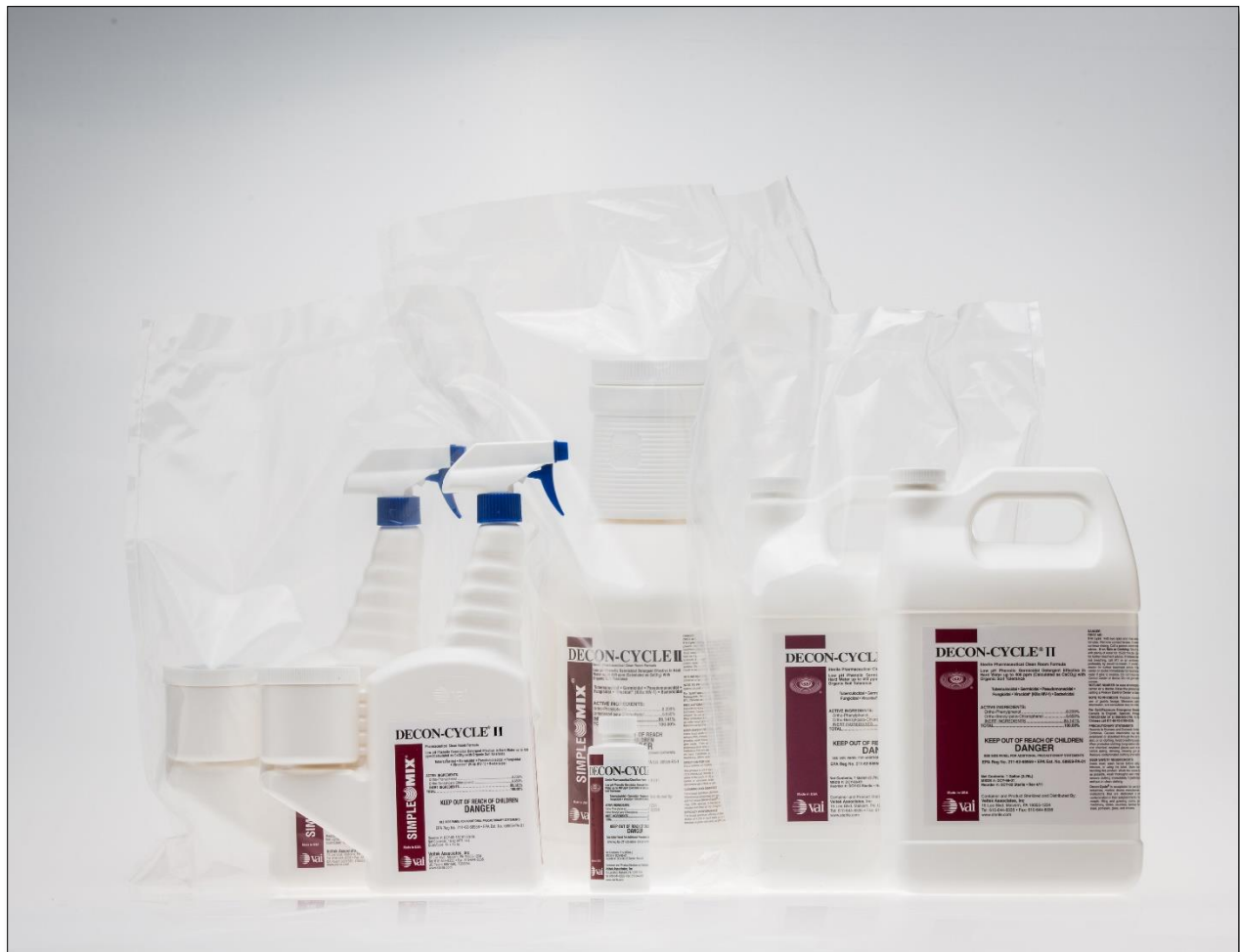
DECON-CYCLE II Family of Products

(Any specific product label is available upon request.)