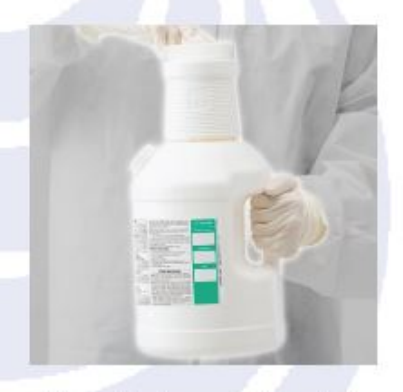
Pour solution from small side spout onto surfaces to be treated or alternate containers.