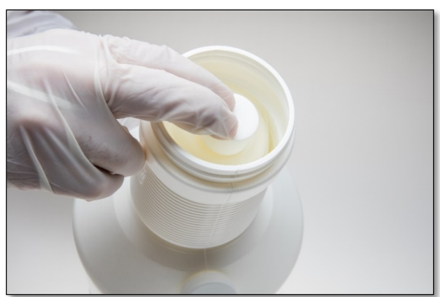
1 gallon SimpleMix Bottle