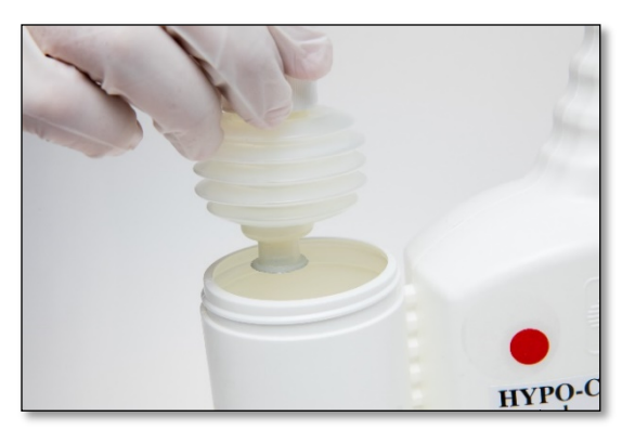
SimpleMix Bottle with Activator

HYPO-CHLOR Neutral 0.25% and 0.52% are activated via the SimpleMix System by neutralizing the pH. The activator is housed in the small chamber suspended above the sodium hypochlorite solution in the large chamber below. Once the SimpleMix plunger is pushed, the activator is mixed into the solution following the SimpleMix directions. Testing has shown that HYPO-CHLOR Neutral Products are effective as neutralized cleaners for up to 24 hours post activation.