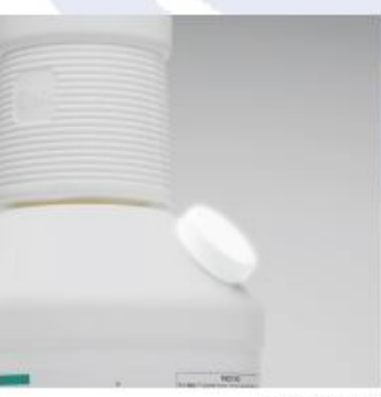
8) Follow directions for use on label.