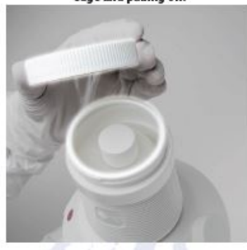
4) Replace cap and tighten.