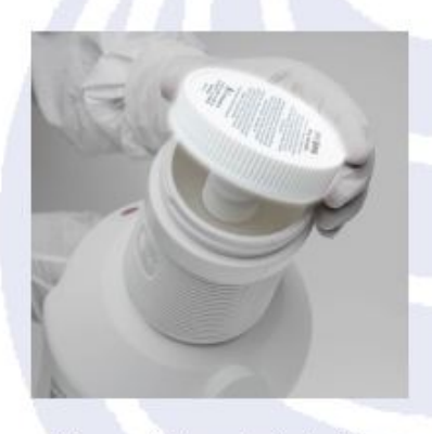
Open small side spout and peel off inner seal, as above.