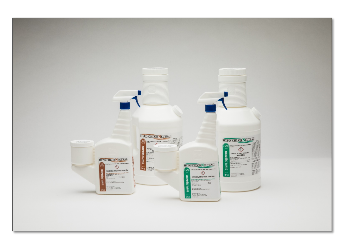
HYPO-CHLOR Neutral Family of Products

(Any specific product label is available upon request.)