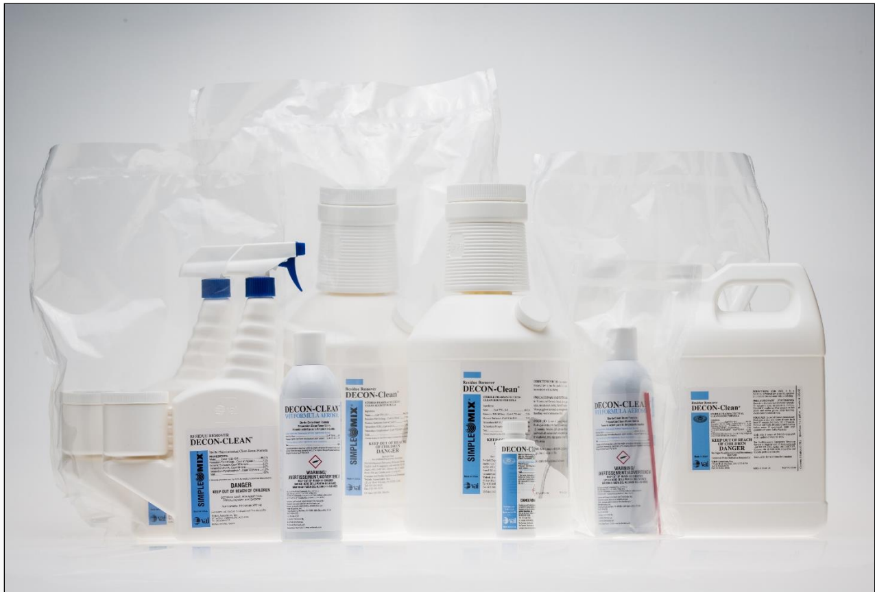
DECON-CLEAN Family of Products

(Any specific product label is available upon request.)